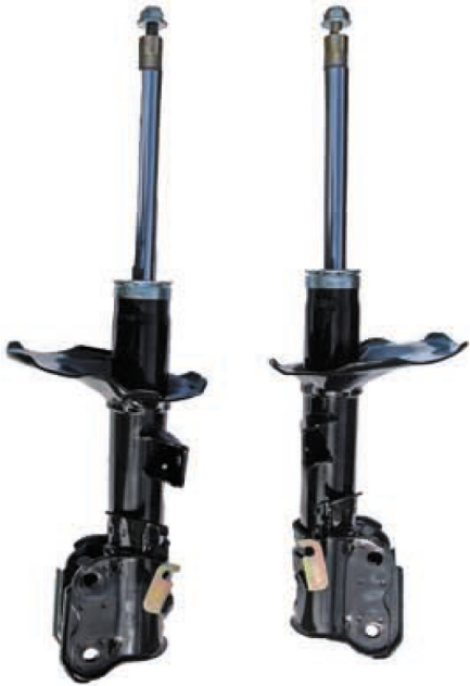
Picture of ABS Bracket & sleeve mounted