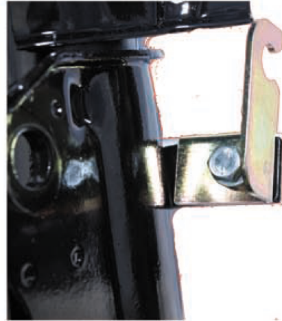
Blown up view of ABS bracket mounted. Note - Thread lock must be used when mounting ABS Bracket